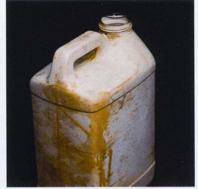
Dried formulation on container.