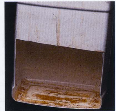
Bottom is caked with dried residue.