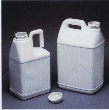
Container, thread, and lip are clean.