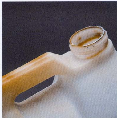
Handle and neck stained but clean.