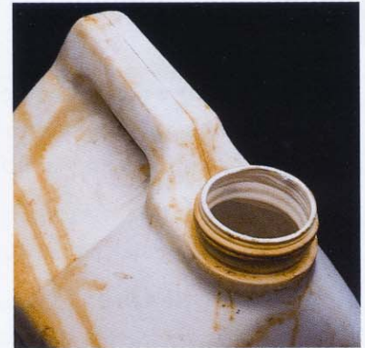
Dried formulation on thread.