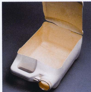
Inside stained but rinsed clean.